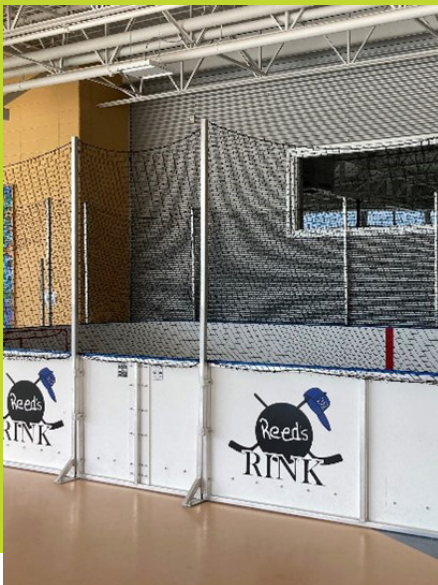
Example of the mini rink at the Slave Lake Multi-Rec Centre