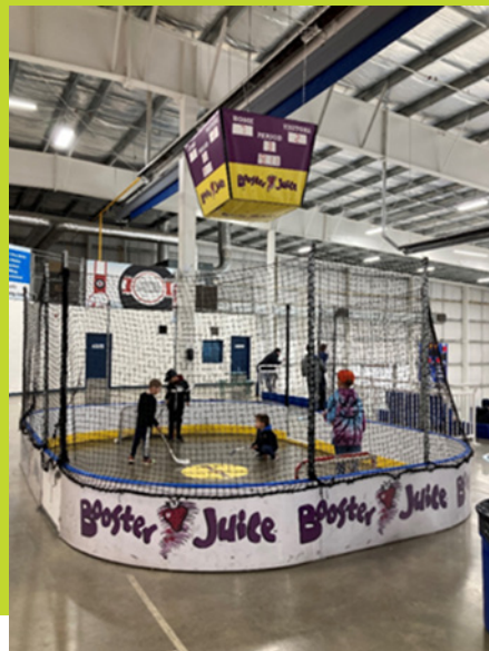
Example of the mini rink at the Tri-leisure Centre in Spruce Grove